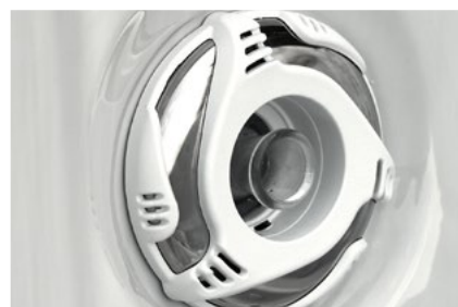
OPTIONAL JET COLOR PACKAGE