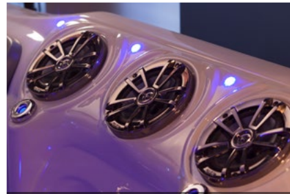
INFINITY™ AUDIO SYSTEM