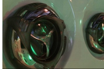
ADJUSTABLE STAINLESS STEEL JETS