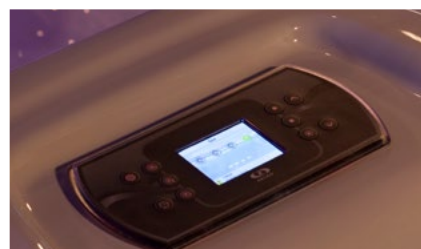
USER FRIENDLY, DIGITAL CONTROLS