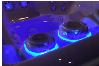
AIR & WATER DIVERTERS