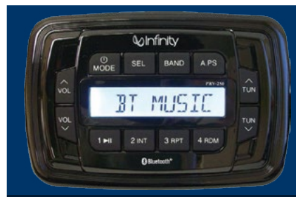
INFINITY™ AUDIO SYSTEM